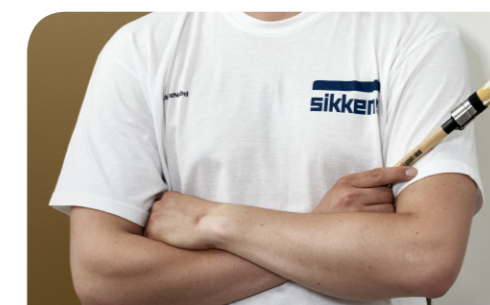
The single-color logo should only appear in Sikkens Dark Blue or reversed out in white. Don't reproduce it in any other colors (unless impossible – for example, on a fax sheet).

ONLY in exceptional cases where multiple colors are not available, such as uniforms or forms, can the Sikkens logo be used as a single-color logo.