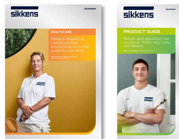
The logo is always placed at the top of the format – top left on brochure and leaflet covers.